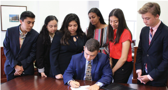
Comfort and confidence in competitive and intellectual environments

Whether or not you are interested in government or politics, LDZ's organizational learning lessons apply to any field, career, or community. At its core, the LDZ journey is driven by self-reflection and personal growth prompted by meaningful experiences in creation, achievement, and development. All sites feature an exclusive college fair, receive expert information on college admissions and financial aid from the hosting university, and have an opportunity to visit a local attraction. Top competitors receive awards and all students are invited to celebrate their achievements at the end of program dance.